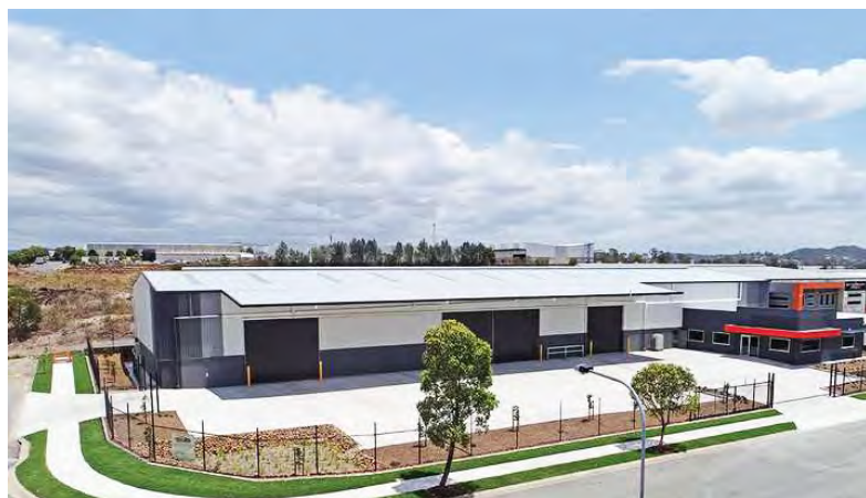
Tomax Yatala, QLD