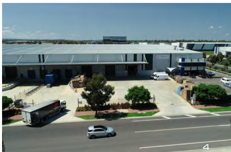
Tomax Dandenong, VIC