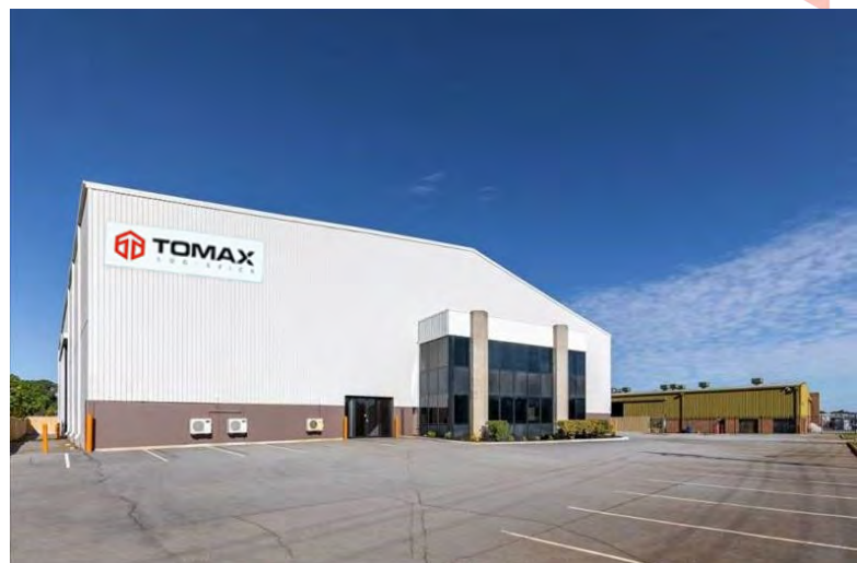
Tomax Welshpool, WA

If you would like to know more about the Tomax range of services on offer please do not hesitate to contact our team on 1300 186 629.